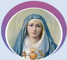
Mother of Sorrows MSFS PATRONESS