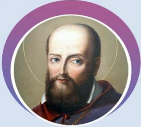
St. Francis De Sales MSFS PATRON